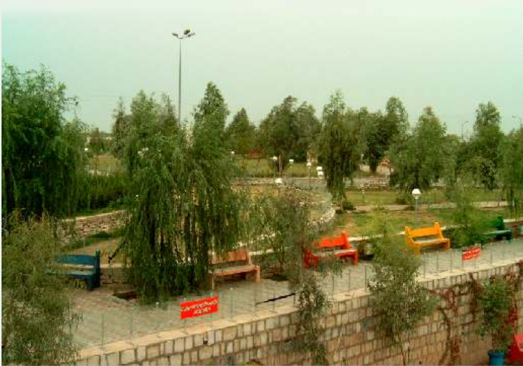
A facet of Azadi Park