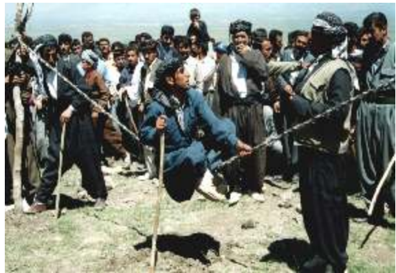
Scenes of a Kurdish Folklore Festival, celebrating ( Nawroz) spring feast.