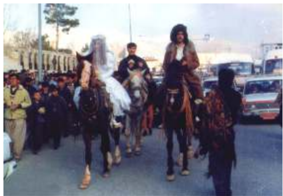
A Kurdish Folkloric wedding ceremony in Sulaimaniya.