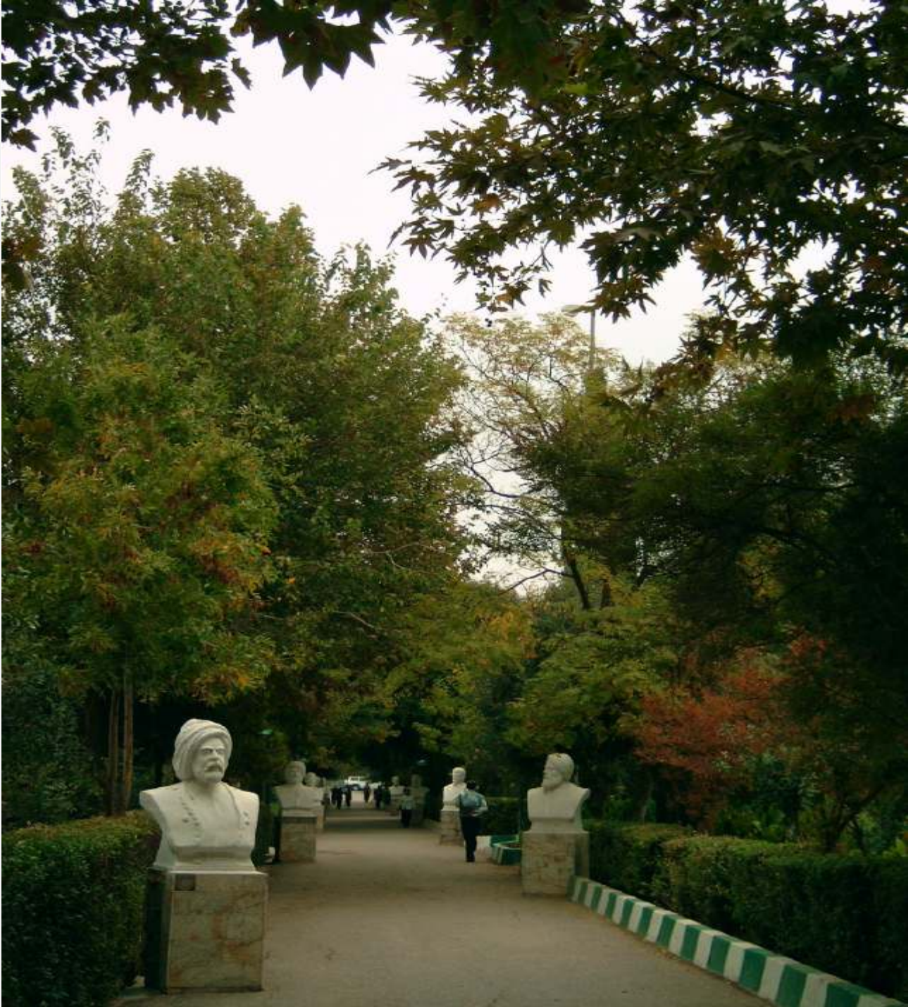
Statues of a group of Kurdish poets and writers in the garden